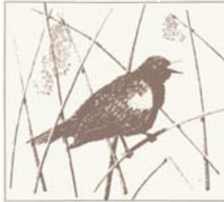
Cover illustration of a redwing blackbird for the San Joaquin Freshwater Marsh brochure.