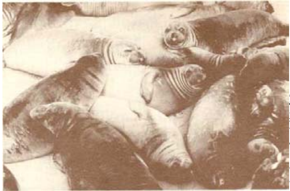
Once decimated by hunting, California's northern elephant seal population has made a remarkable recovery. Año Nuevo's population annually produces some 1200 pups, such as the newly-weaned pups seen here.