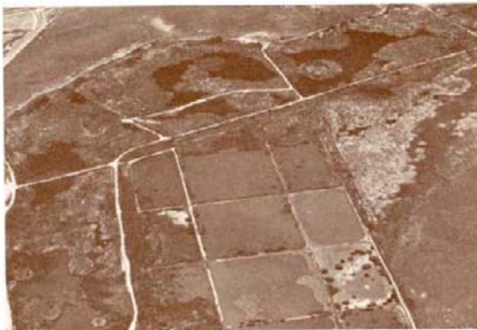
San Joaquin Freshwater Marsh Reserve features multiple ponds and water control structures that allow researchers to manipulate environmental factors affecting mosquitos.

The study is a multi-disciplinary project of the UC Irvine Departments of Ecology & Evolutionary Biology and Developmental & Cell Biology, the Orange County Vector Control District (OCVCD), and the UC Natural Reserve System. The goal is to develop mosquito control techniques that are compatible with environmental management objectives for natural wetlands. These objectives include endangered species preservation, migratory waterfowl habitat management, and habitat preservation for teaching and research use.