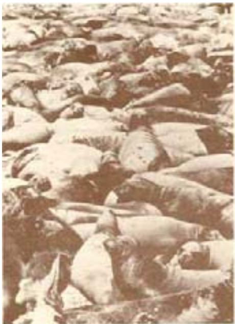
Año Nuevo Island supports five species of pinnipeds—the most diverse population in the lower 48 states with the exception of California's San Miguel Island.