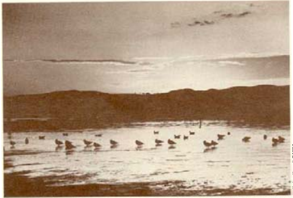
Marbled godwits forage for invertebrates in the Bodega Harbor mudflats at dawn. Two months after this photo was taken, the mudflats were covered with a film of oil from the tanker S.S. Puerto Rican.

From a research perspective, the impacts of the spill may already be significant. The Bodega Marine Reserve is a national baseline monitoring and inter-calibration site for the U.S. Mussel Watch Program. Mussel Watch uses bio-assays of the mussels, Mytilus californianus and M. edulus , to