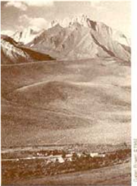
Mount Morrison and the Convict Creek moraine loom over the Sierra Nevada Aquatic Research Laboratory (SNARL) near Mammoth Lakes, California. Convict Creek flows through the lab complex at the bottom of the photo.

The grant will be applied to the construction of $165,000 in facilities improvements at SNARL to double user housing and laboratory space. At present, SNARL can accommodate 11 to 15 people for long periods and up to 27 people for short periods. The Reserve's housing and lab space have been used to capacity—both summer and winter—the past five years, and many users have had to be turned away.