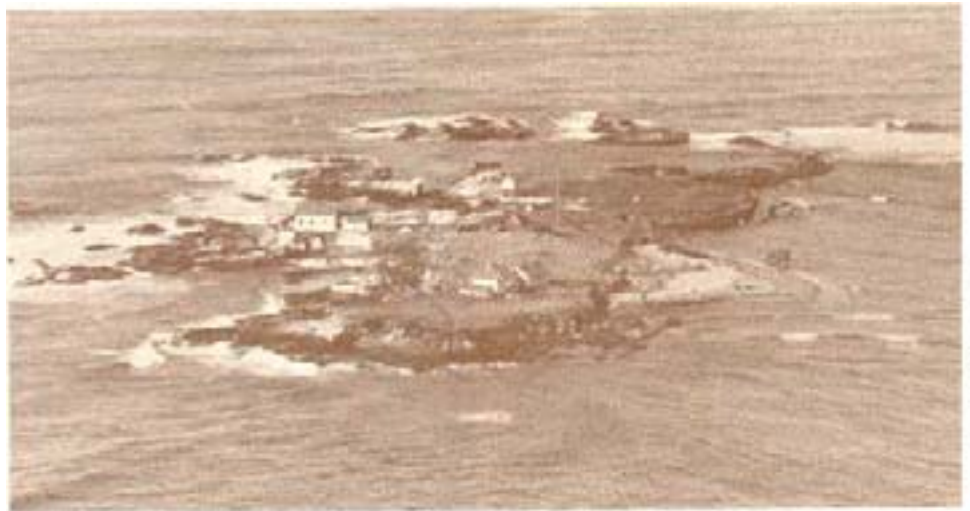
This aerial view shows eight-acre Año Nuevo Island and the former Coast Guard facilities now being renovated with NSF funding. The foghorn building is on the left, and the blockhouse is in the middle of the photo. The lightkeeper's house in the foreground is no longer used.

Another physiological study investigates sleep apnea in elephant seals. Sleep apnea is the temporary cessation of breathing during sleep. A pilot study found that an increase in respiratory carbon dioxide during sleep could stimulate the resumption of breathing during sleep apnea. Since Sudden Infant Death Syndrome (SIDS) in humans may result from insensitivity to carbon dioxide during sleep apnea, re-