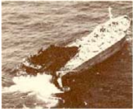
This aerial view shows the bow of the oil tanker S.S. Puerto Rican being towed into San Francisco Bay for cargo pump-out.

Once collected, each sample will be frozen and stored for subsequent analysis. Researchers will tally species presence and abundance for each sample. They will then use gas chromatography/flame ionization to analyze sediment extracts and selected tissue samples for pollutants. For samples requiring more detailed analysis, a gas chromatograph/mass spectrometer will be used. These tests will allow researchers to determine the exact hydrocarbons present in the slick and their relative concentrations.